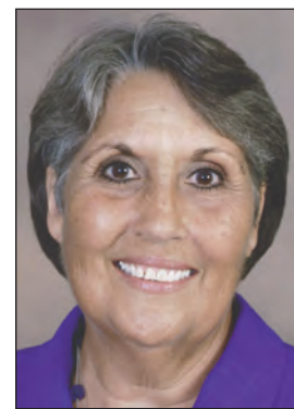
of Farmerville, LA.