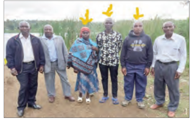
Before the Feast ended, three repentant souls were buried in the waters of baptism.