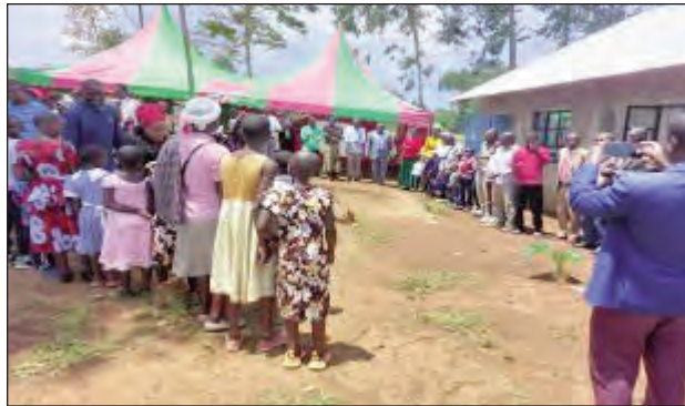
Over 150 attended the Nyamanga (Migori County) Feast of Tabernacles site.

The theme for the 2021 Feast of Tabernacles was “Preparing for the actual Millennium.” The key song: