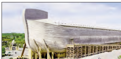
Brethren enjoyed the "Ark Encounter" at Feast 2021.