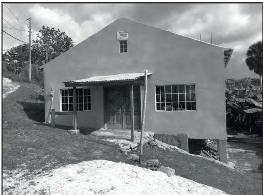
Maroon Town Congregational Building