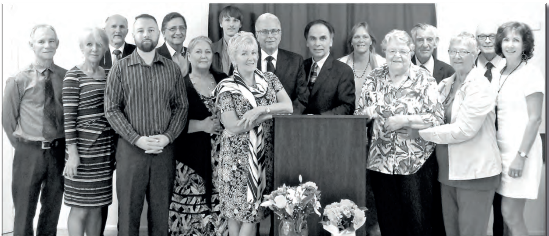
The Slack Creek CGI Congregation in Australia