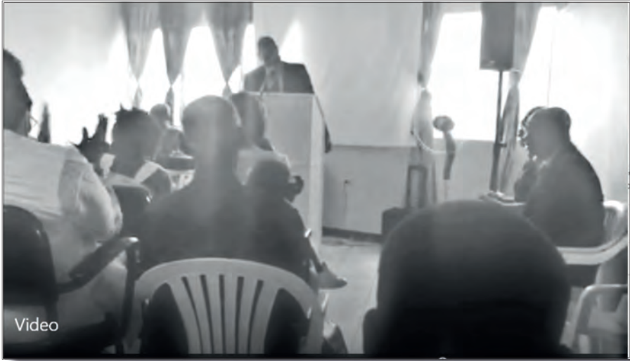
Ocho Rios Congregation