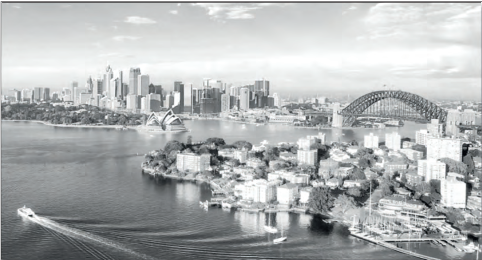
Beautiful Sydney, Australia