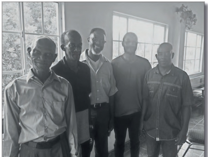
The Maroon Town Board Members